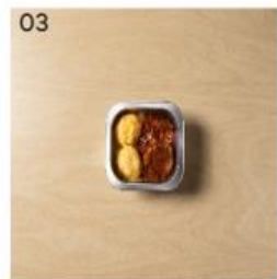
Beef & Vege Rissoles with