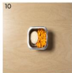
Butter Chicken served with Rice