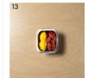
Beef Meatballs & Tomato Sauce on