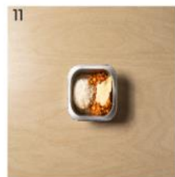
Tex-Mex Beef & Beans with Rice &