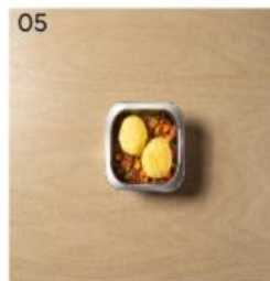
Beef Cottage Pie & Veg with