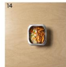
Chicken Teriyaki Rice Bowl with