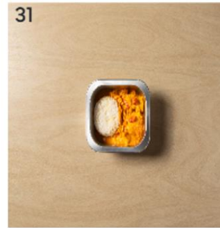
Thai Jungle Curry Chicken & Veg